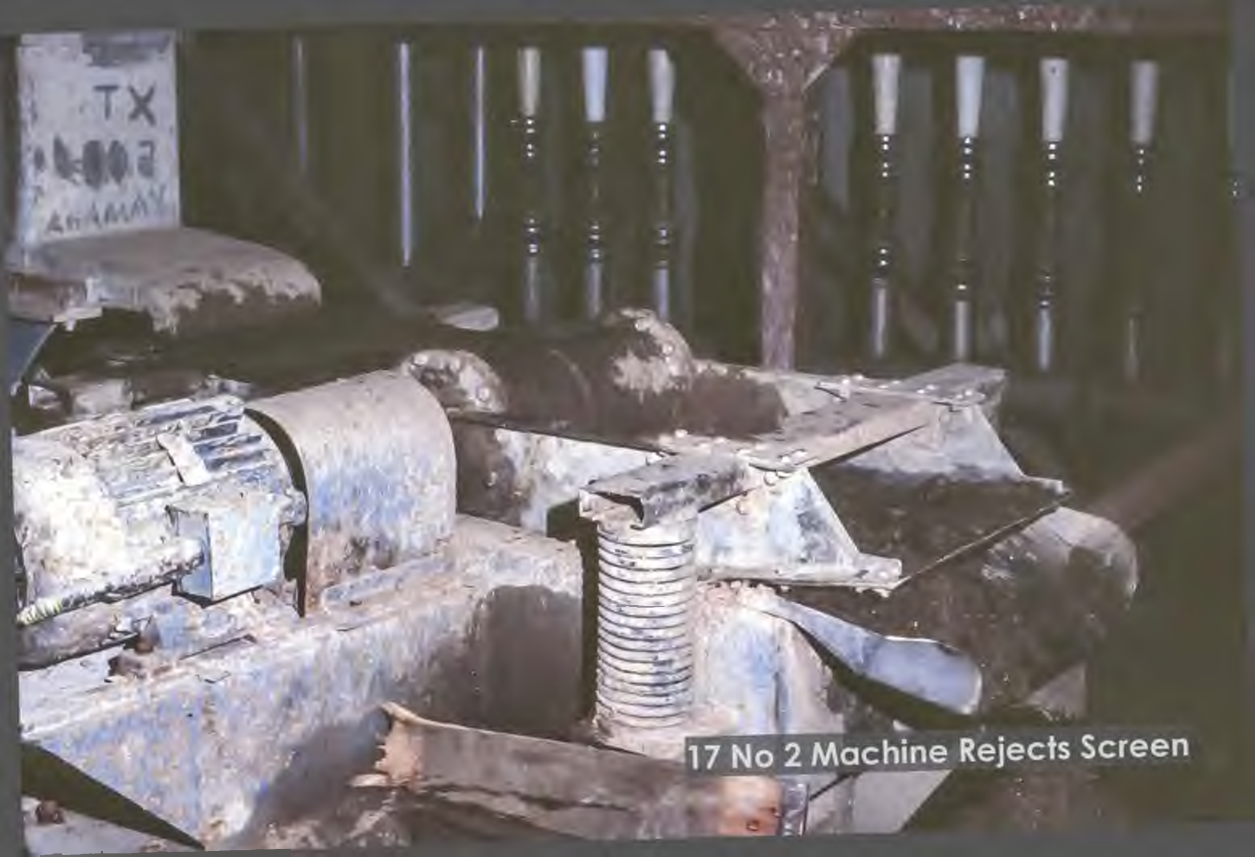
17 No 2 Machine Rejects Screen