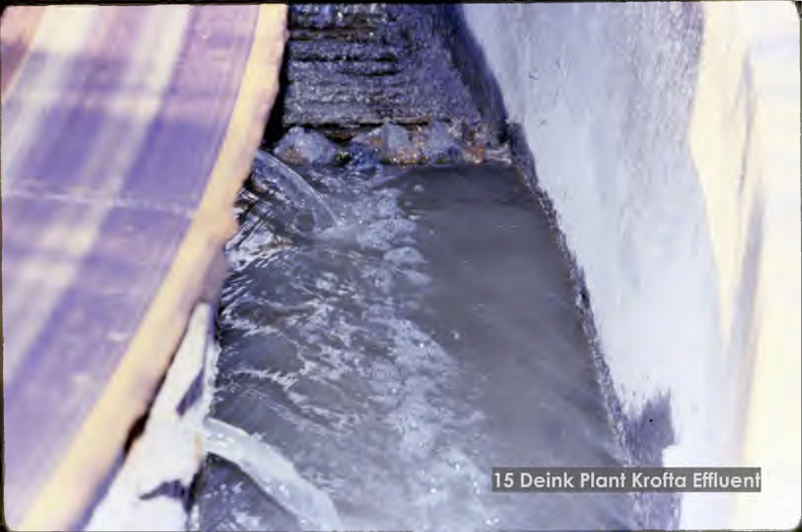
15 Deink Plant Krofta Effluent