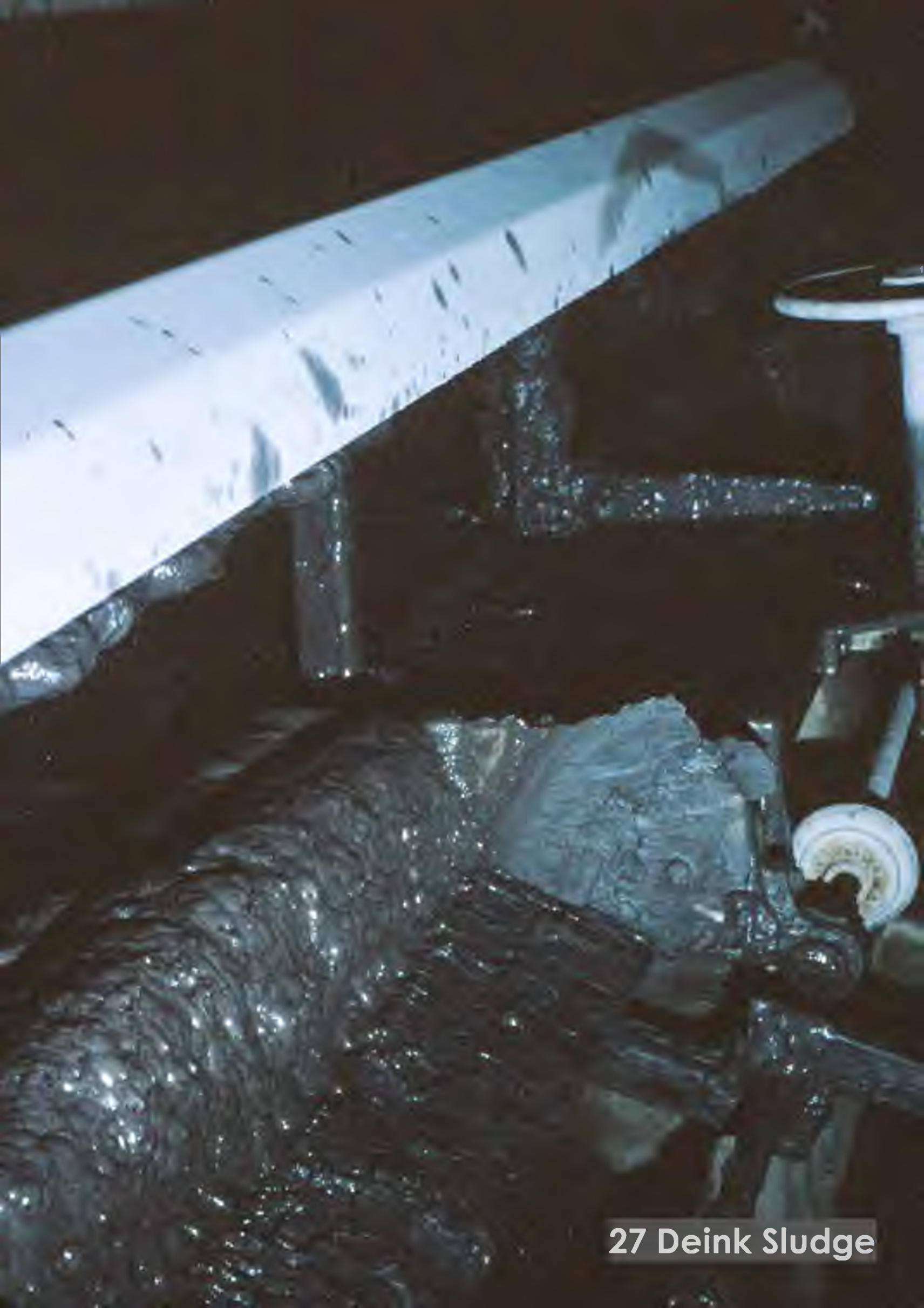
27 Deink Sludge