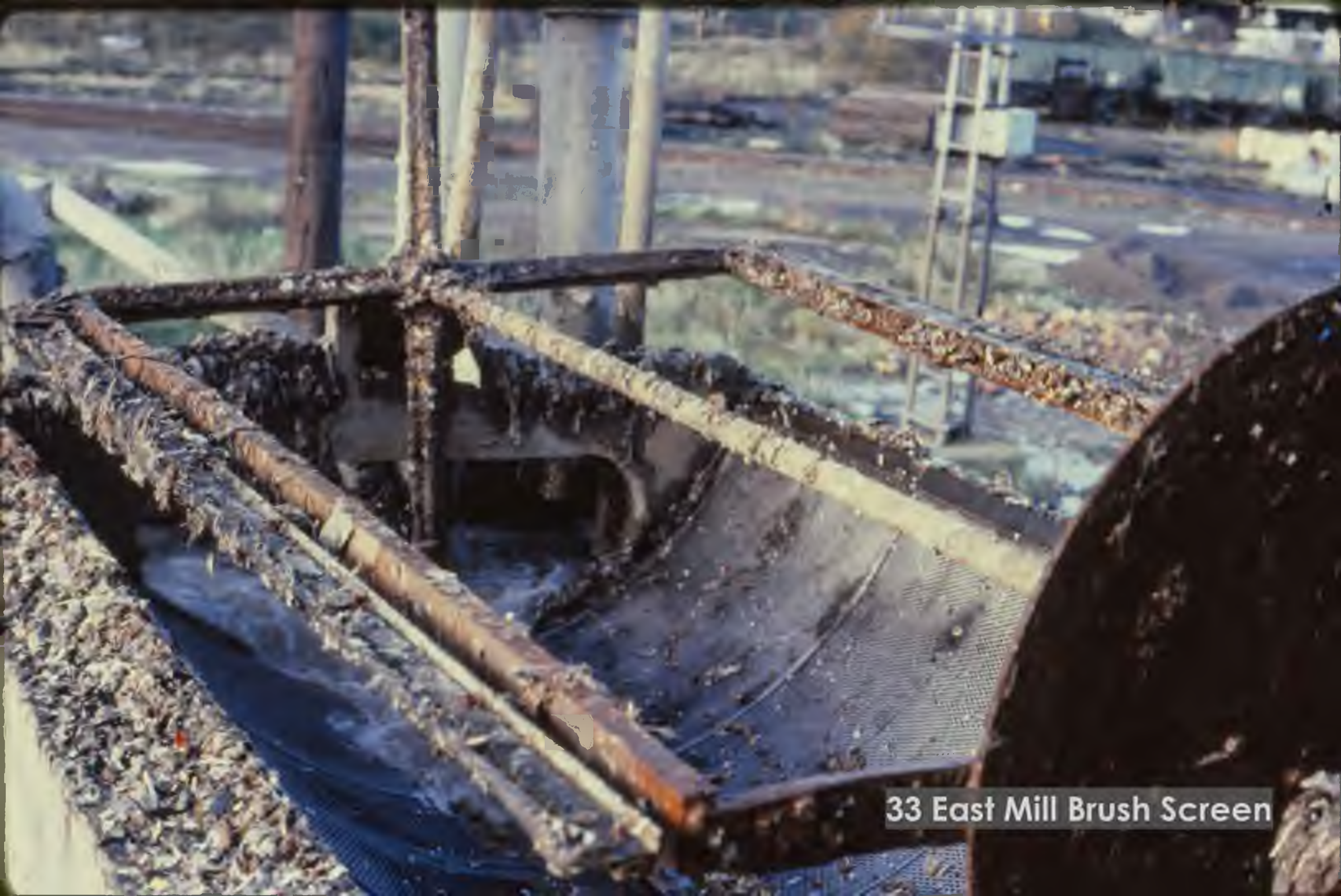
33 East Mill Brush Screen