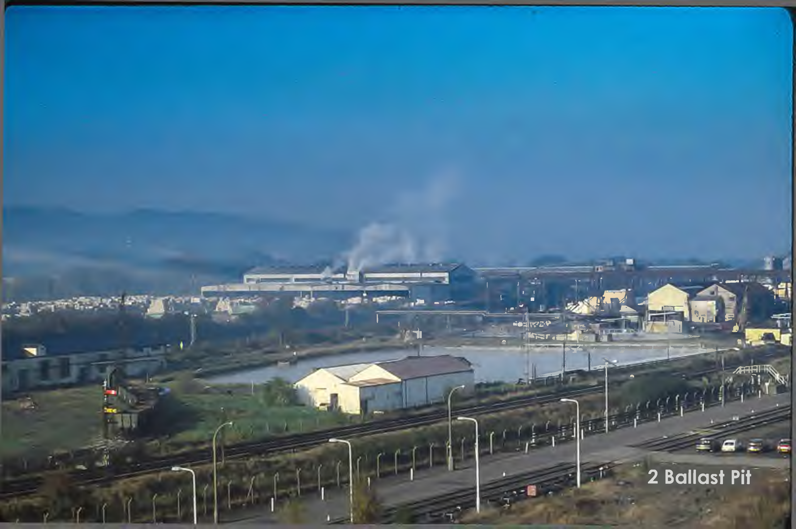
2 Ballast Pit