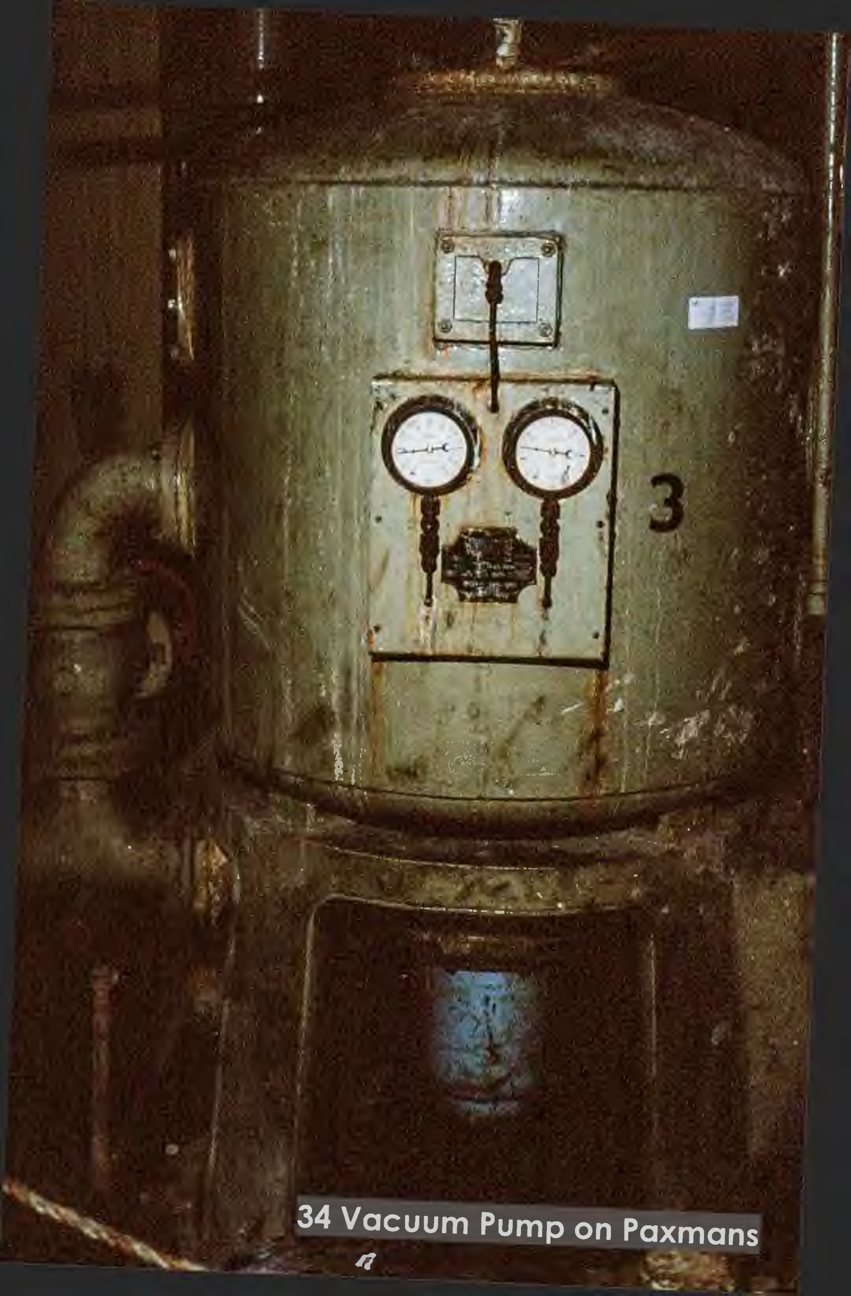
34 Vacuum Pump on Paxmans