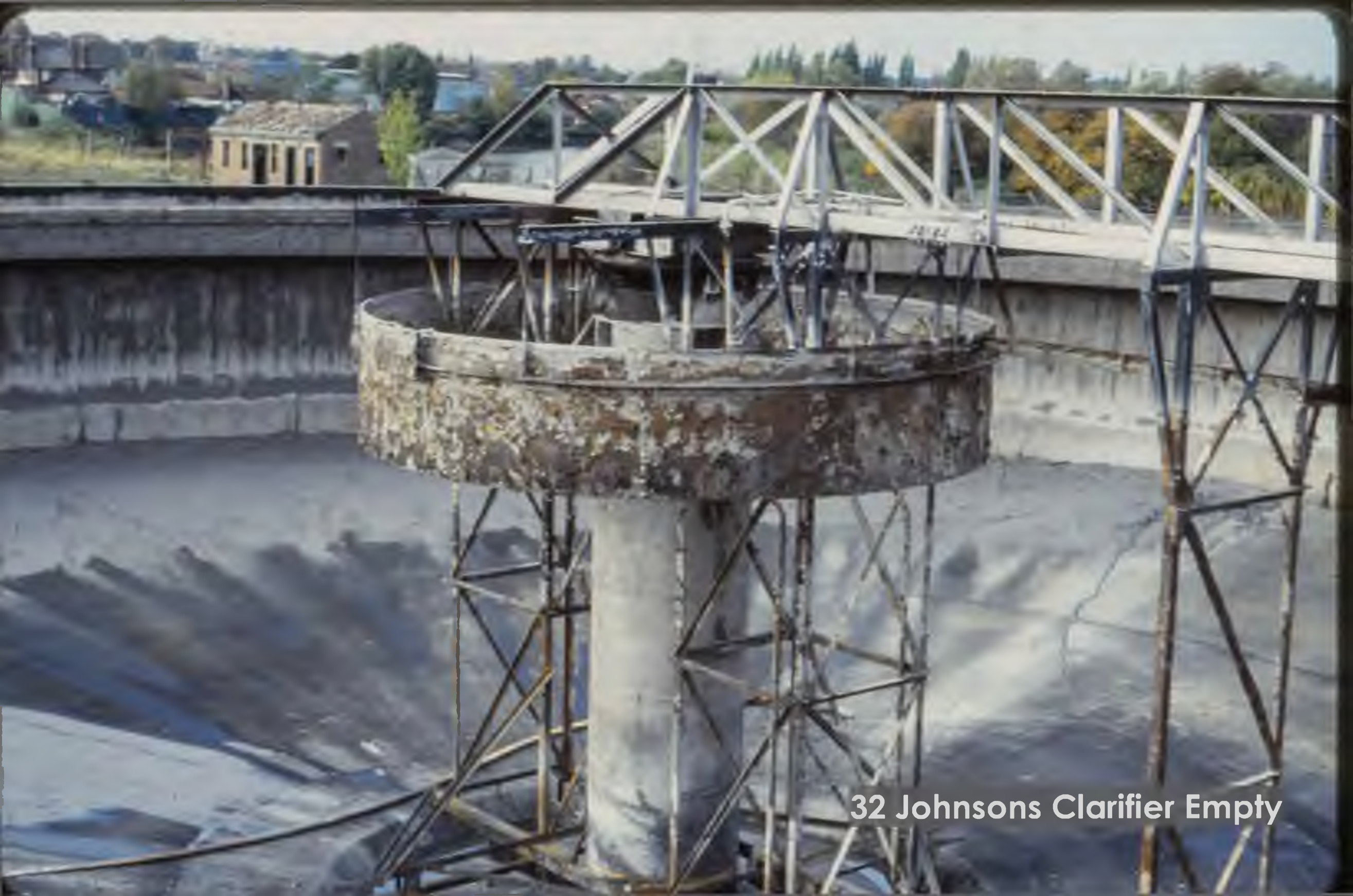
32 Johnsons Clarifier Empty