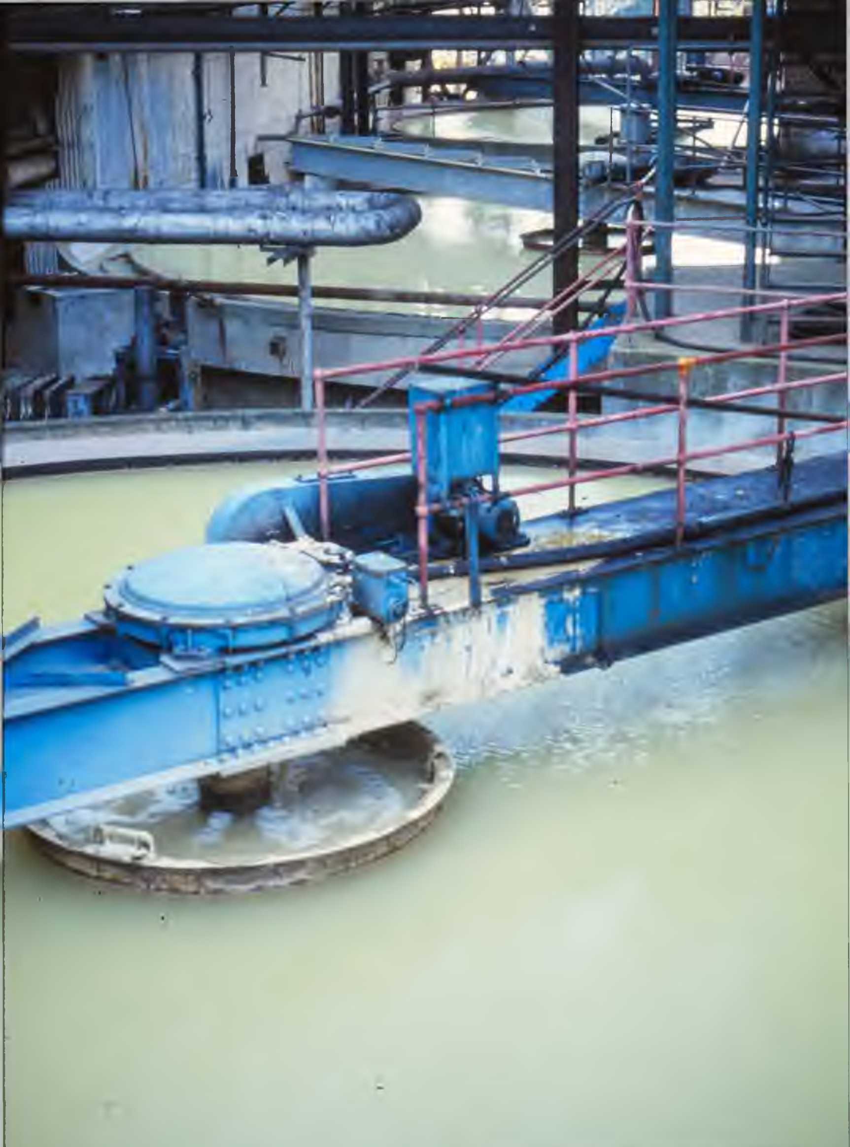
12 West Mill Clarifiers