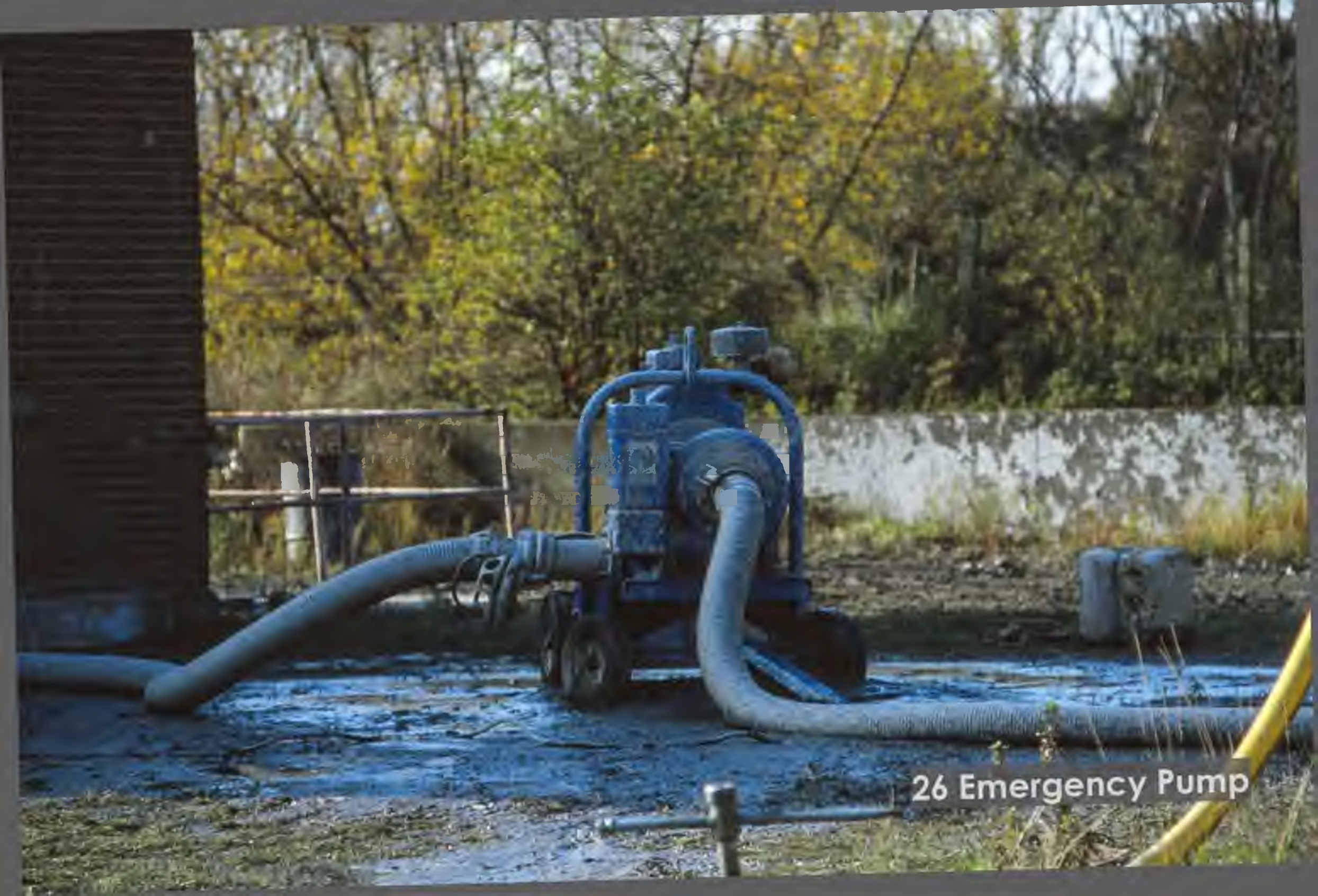
26 Emergency Pump