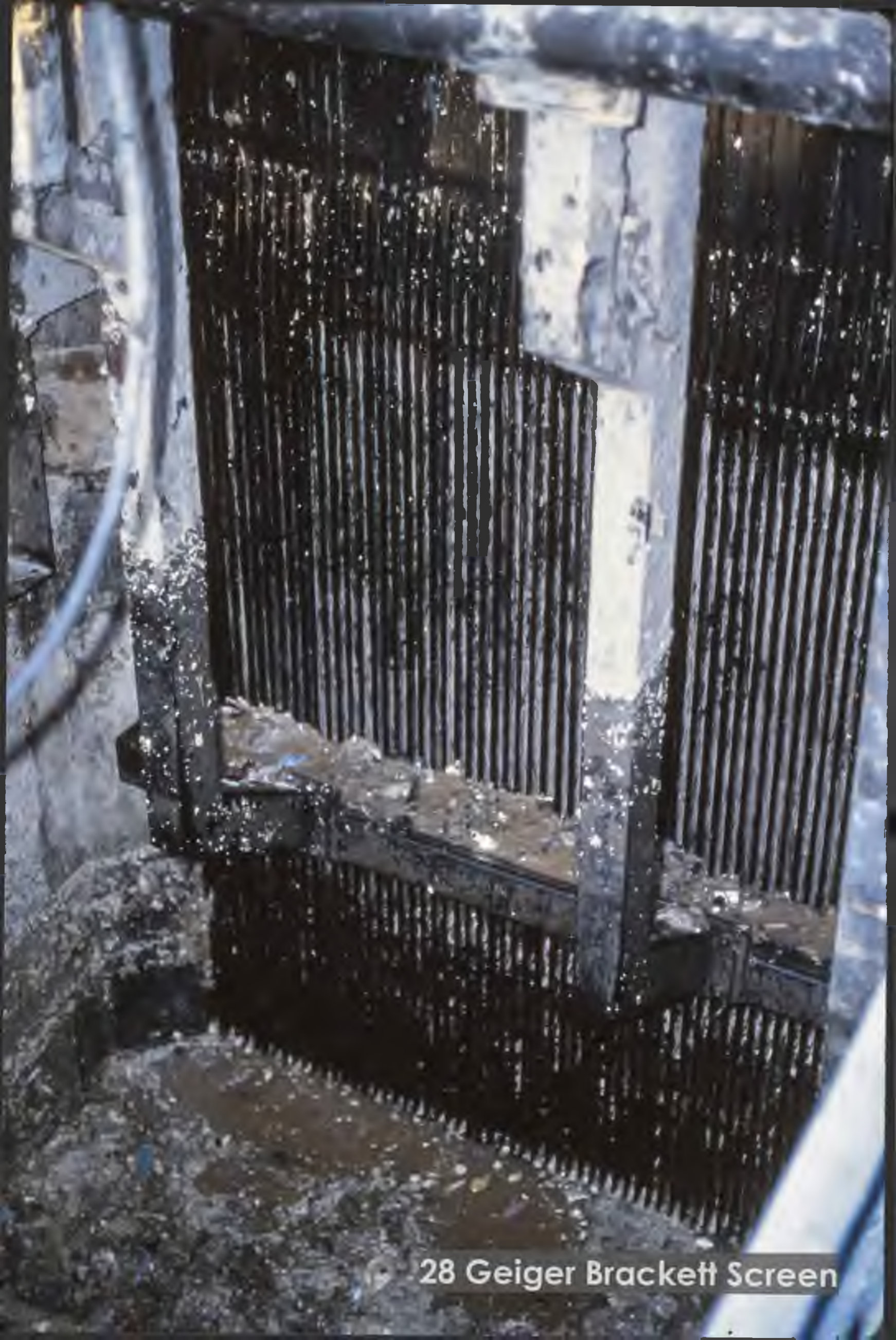
28 Geiger Brackett Screen