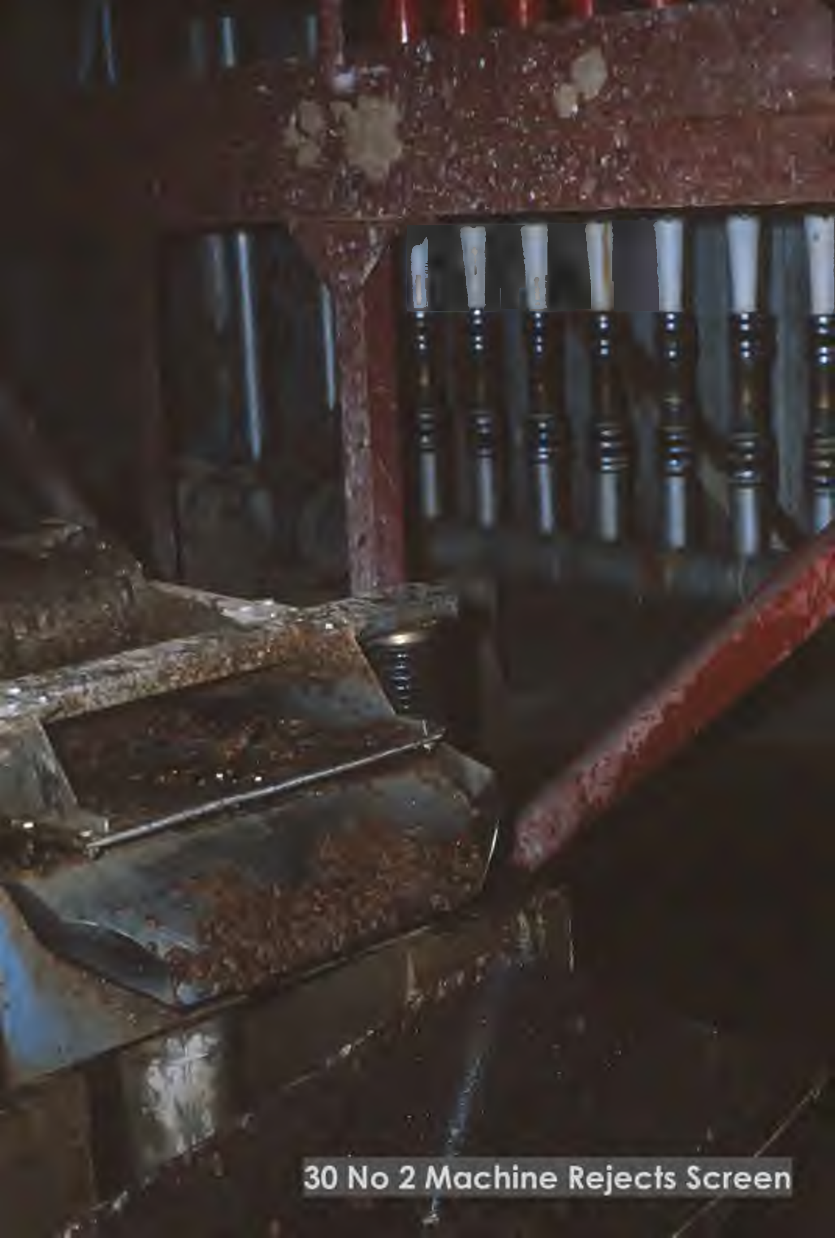
30 No 2 Machine Rejects Screen