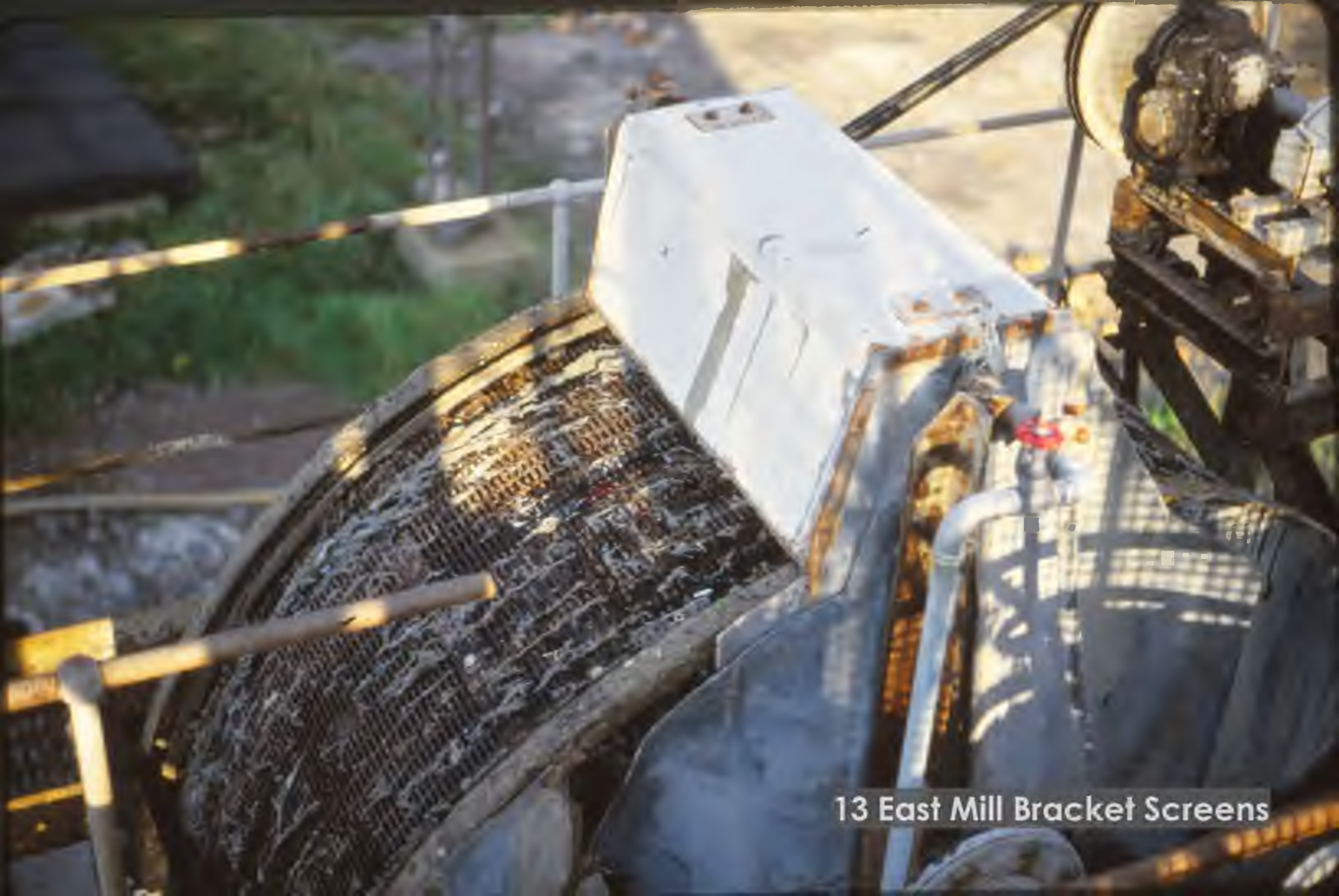
13 East Mill Bracket Screens