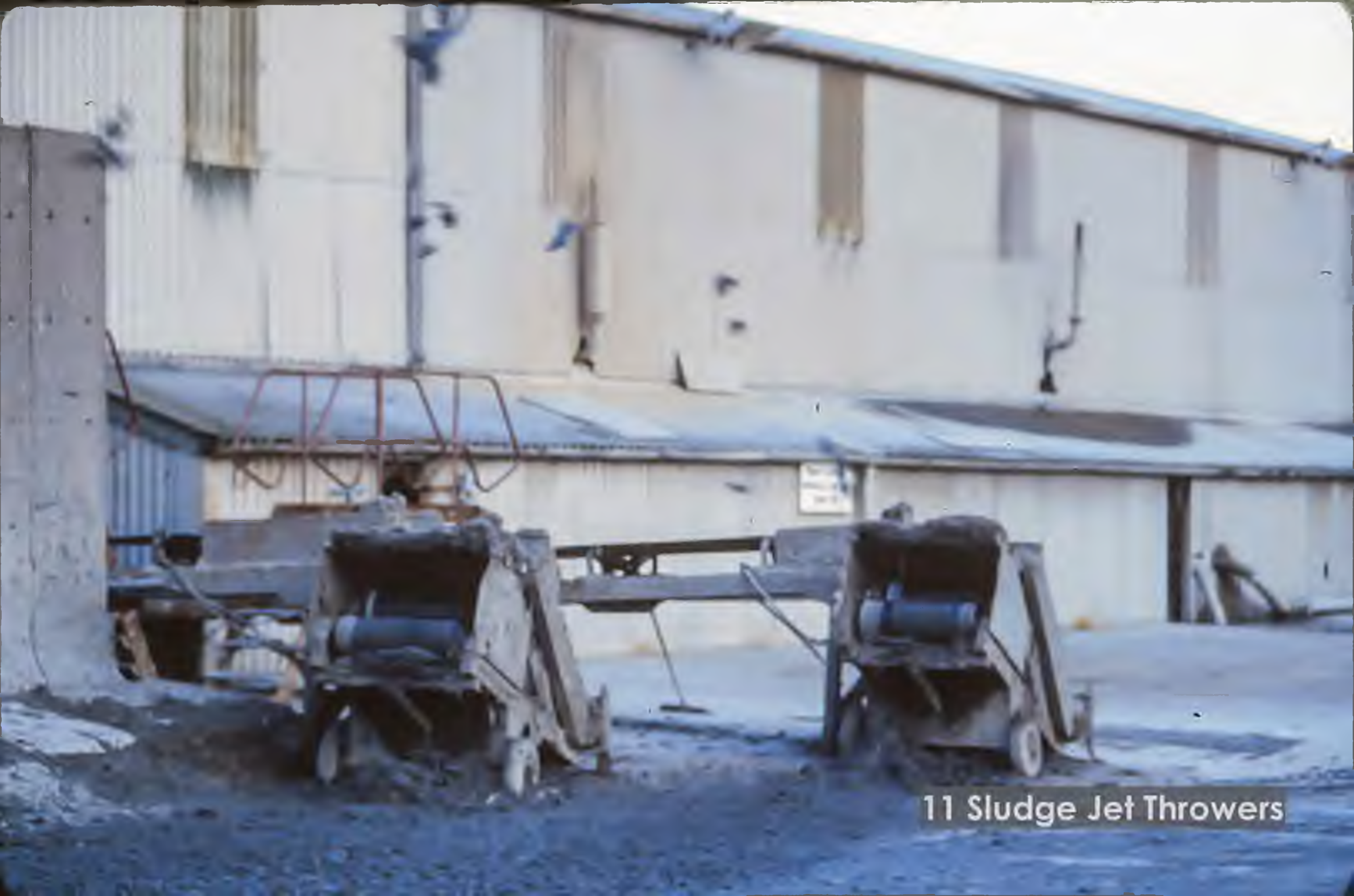
11 Sludge Jet Throwers