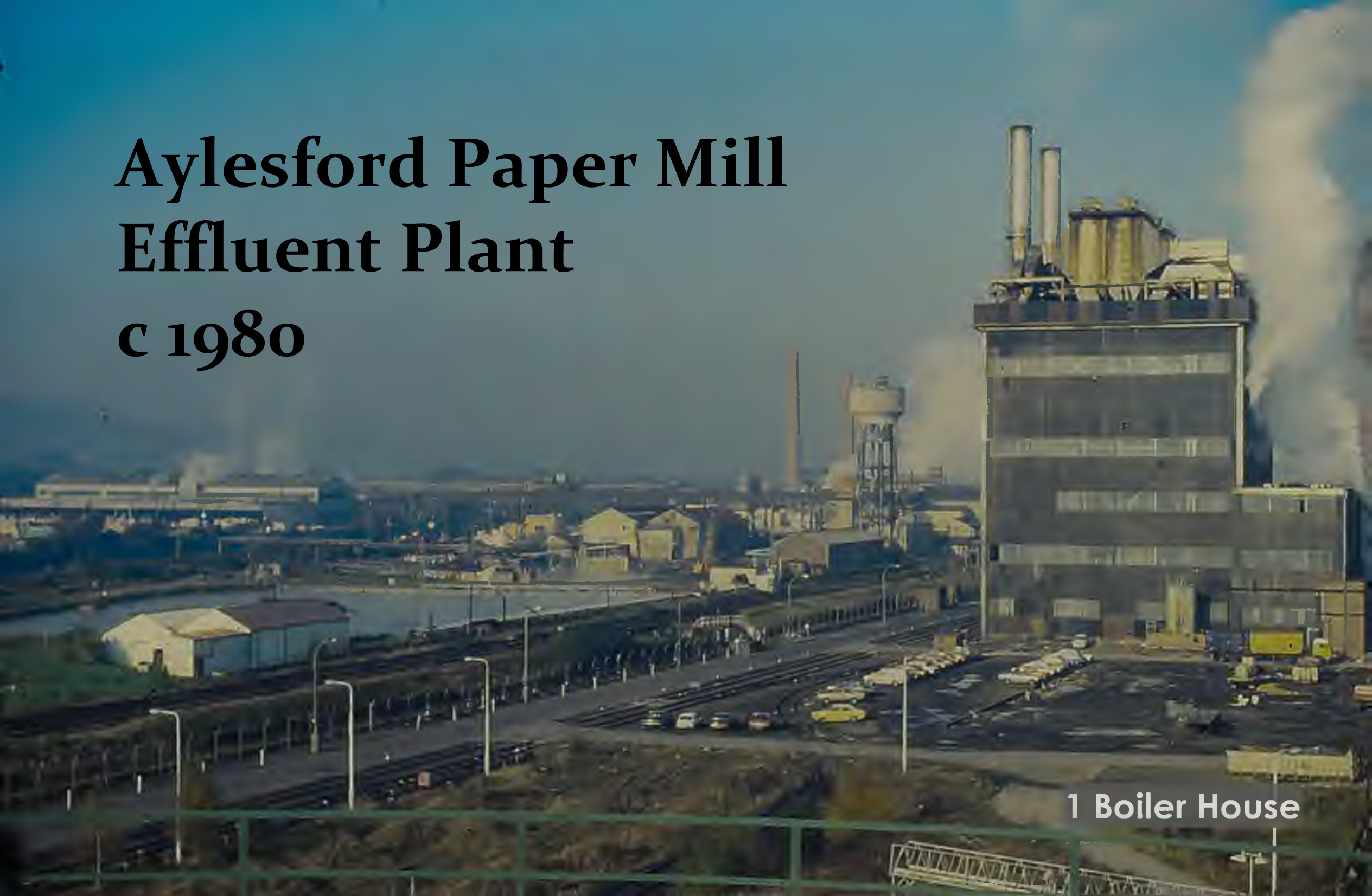
1 Boiler House