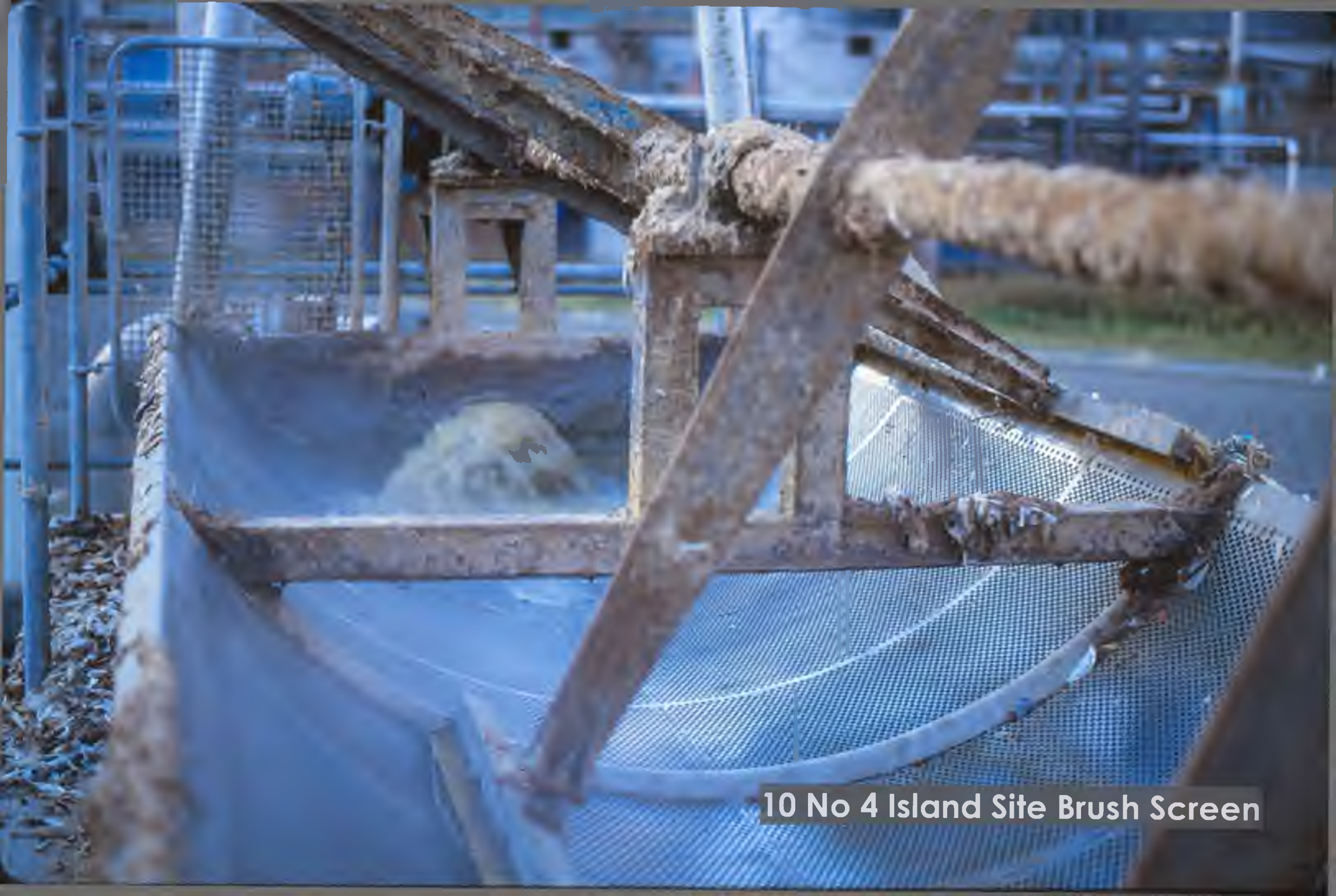
10 No 4 Island Site Brush Screen