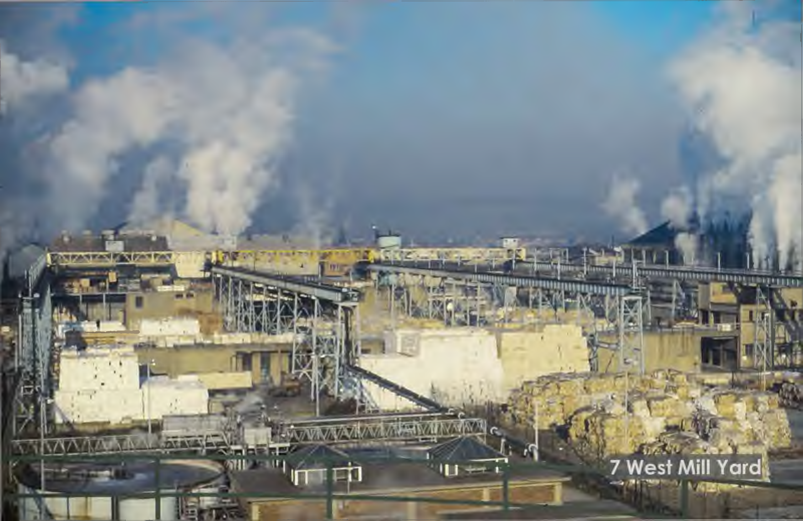
7 West Mill Yard