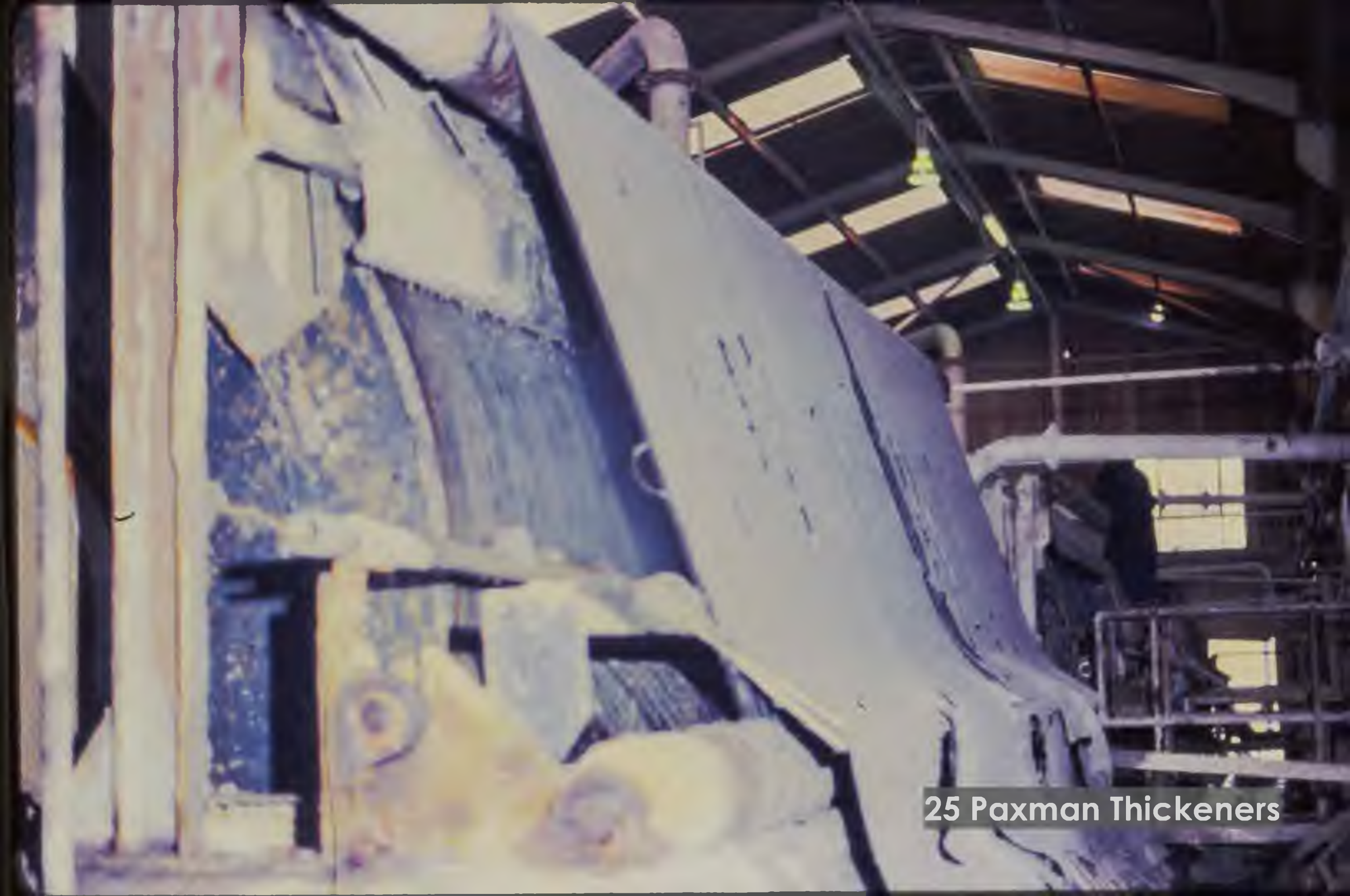
25 Paxman Thickeners