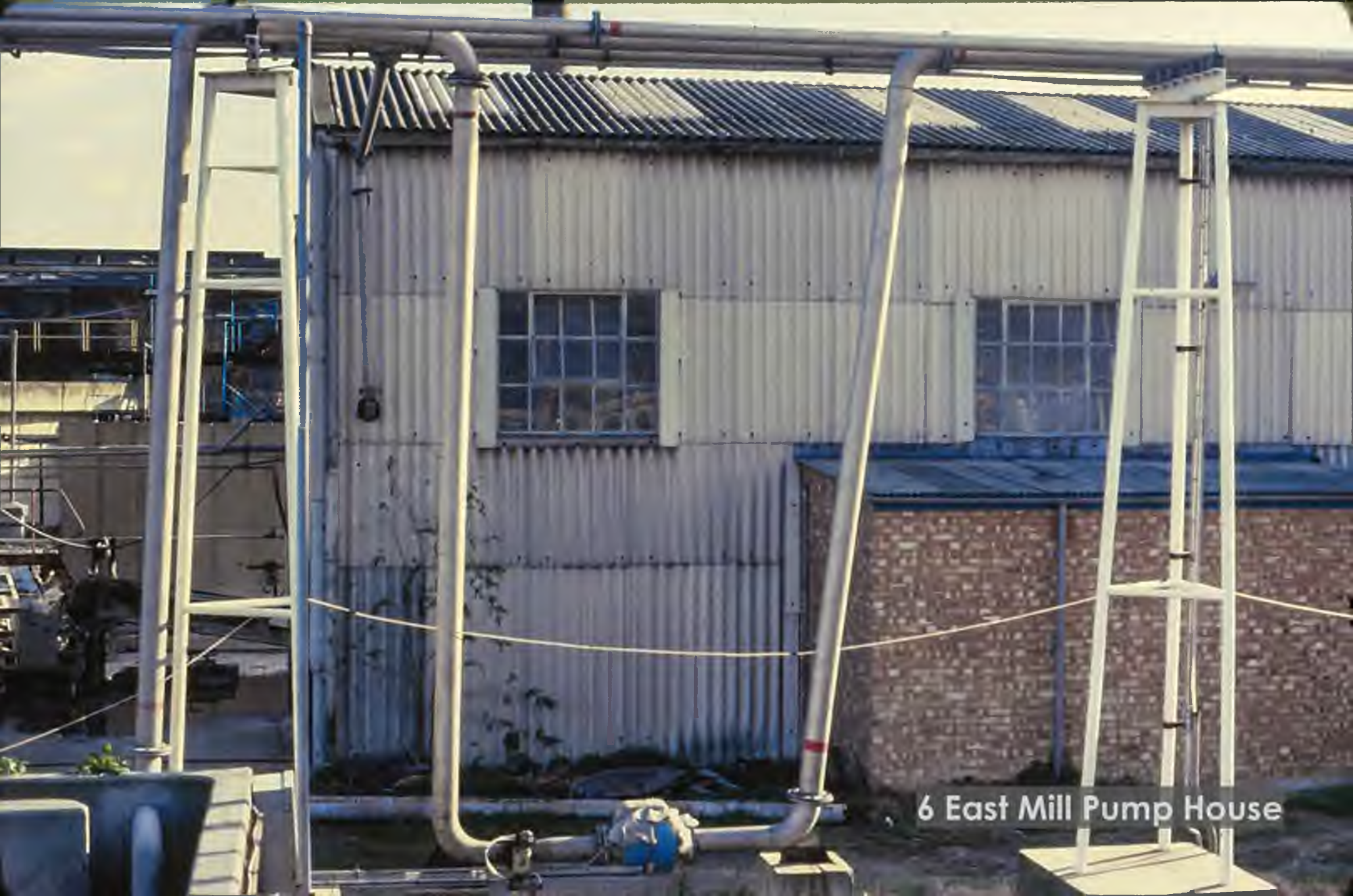
6 East Mill Pump House