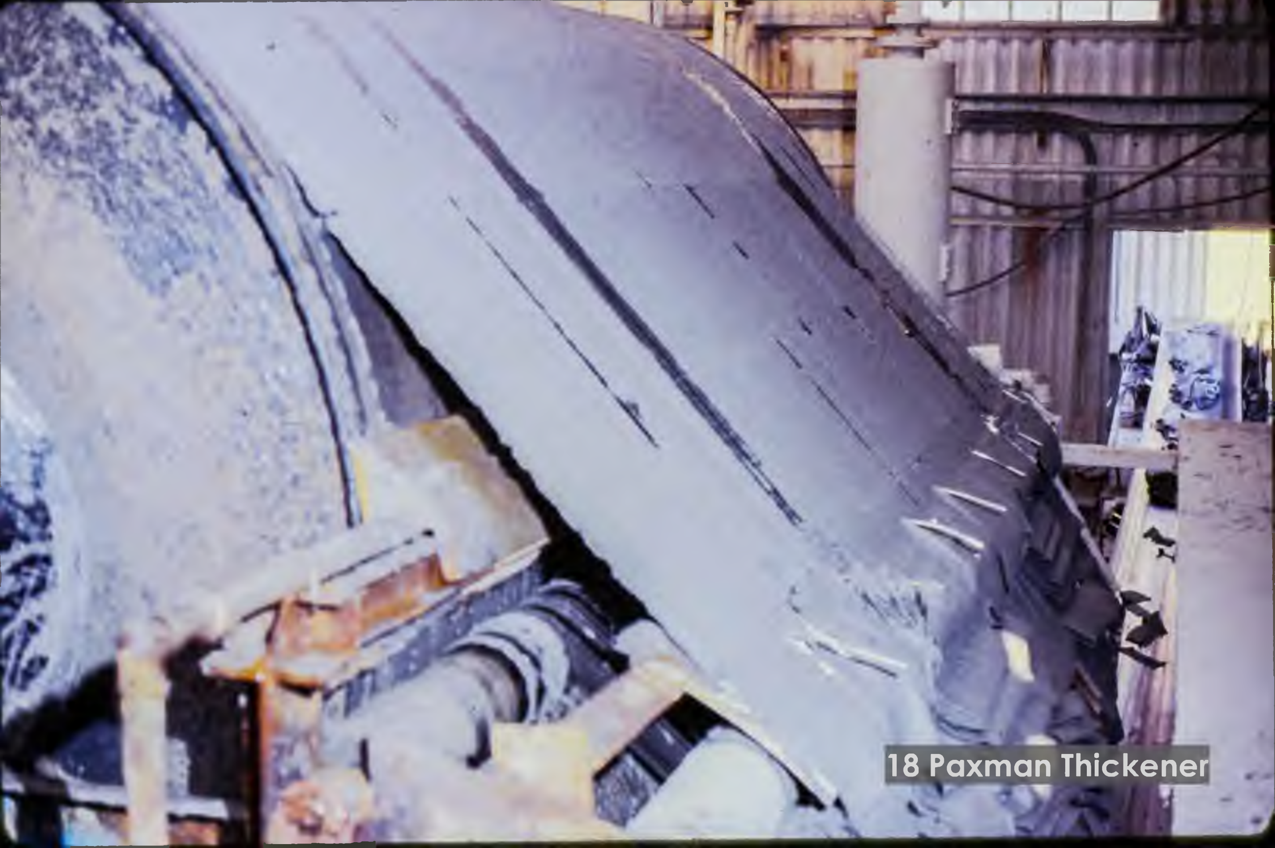
18 Paxman Thickener