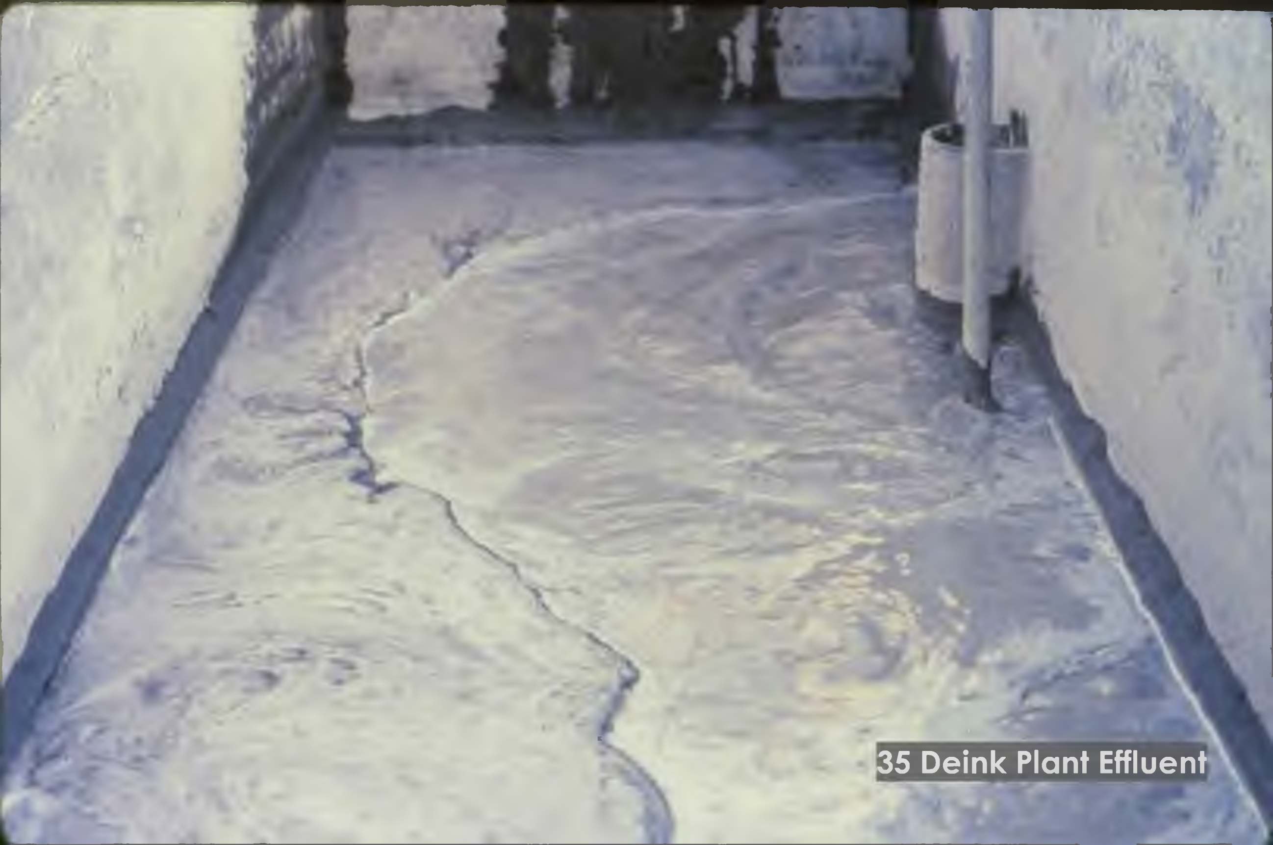
35 Deink Plant Effluent