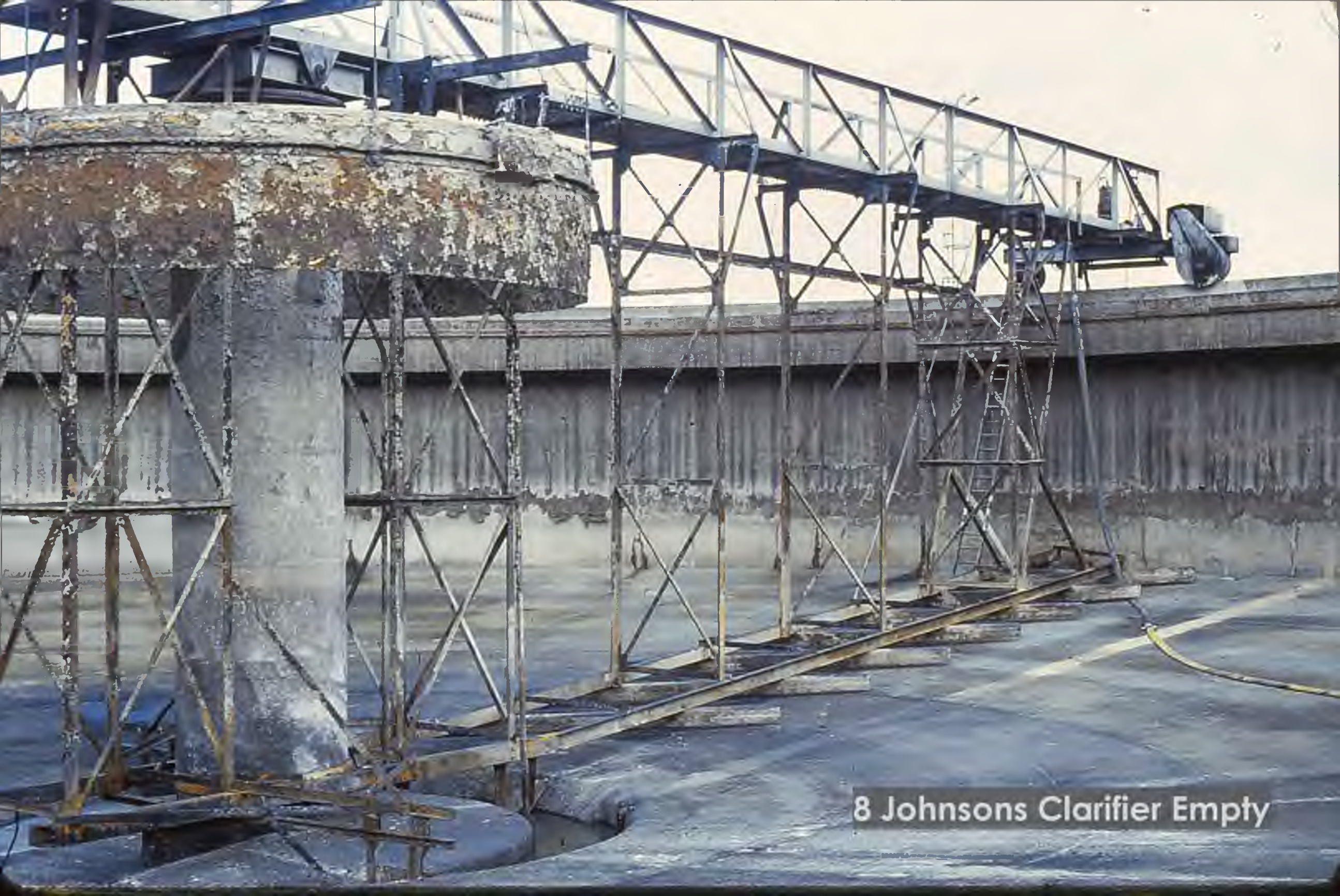
8 Johnsons Clarifier Empty